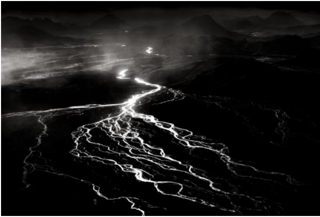
07_Glacier River, Highlands, Iceland, 2020