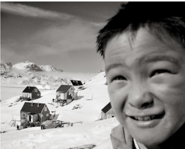
09_Sermiliqag, Greenland, 1997