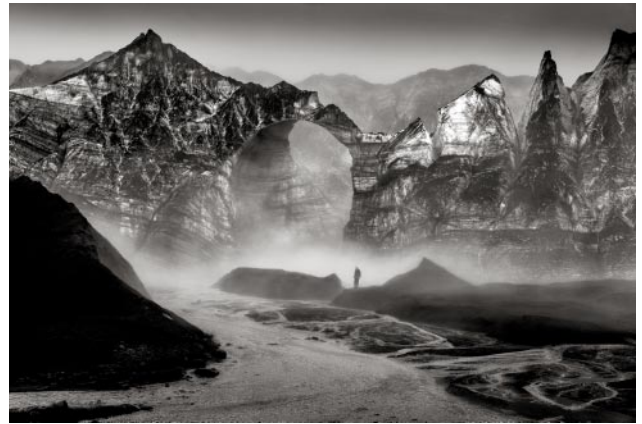
08_Kötlujökull Melting, Iceland, 2021